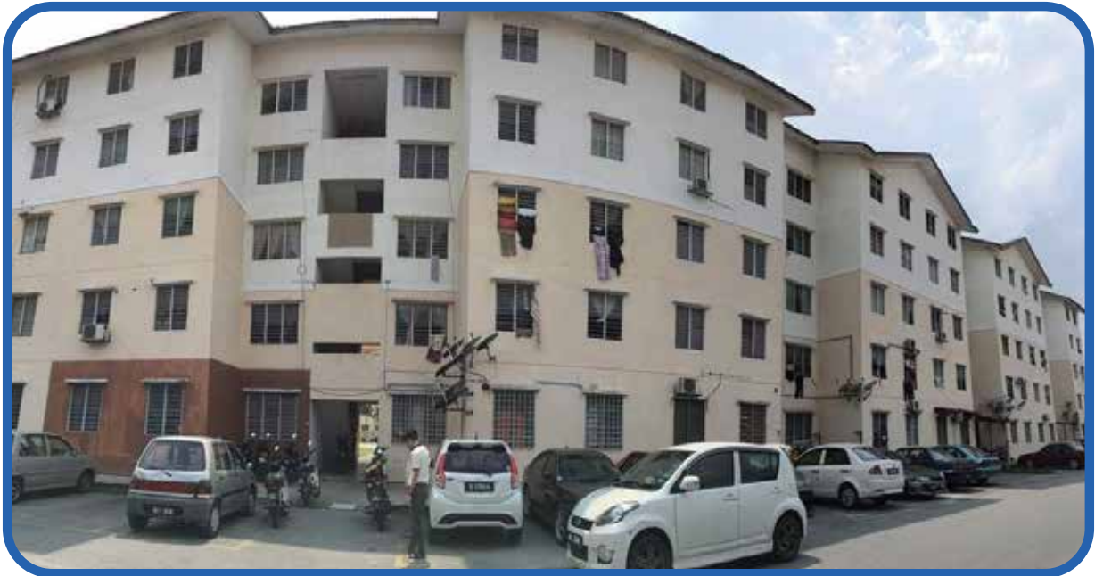
Foreign Worker Welfare - Hostel Facilities