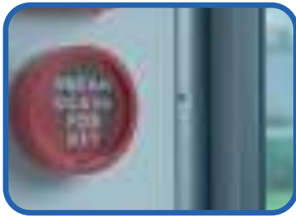
Emergency Break Glass